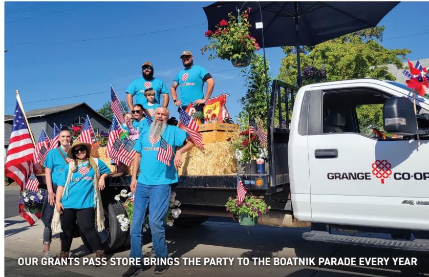
OUR GRANTS PASS STORE BRINGS THE PARTY TO THE BOATNIK PARADE EVERY YEAR