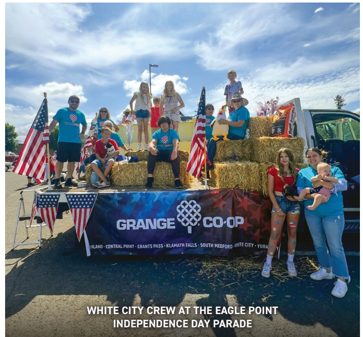
WHITE CITY CREW AT THE EAGLE POINT INDEPENDENCE DAY PARADE