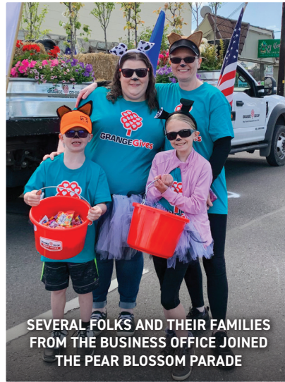
SEVERAL FOLKS AND THEIR FAMILIES FROM THE BUSINESS OFFICE JOINED THE PEAR BLOSSOM PARADE