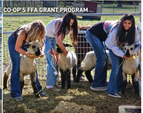
CO-OP'S FFA GRANT PROGRAM