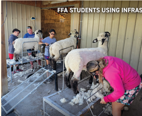
FFA STUDENTS USING INFRASTRUCTURE AND SUPPLIES FACILITATED BY GRANGE

classes to on-campus farming infrastructure. Stay tuned for further updates and watch for our monthly Community Newsletters so you can see what these awesome chapters in Oregon and California are developing in a community near you!