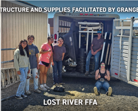
LOST RIVER FFA