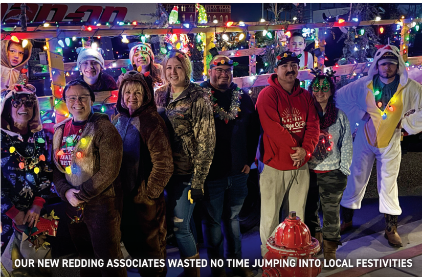
OUR NEW REDDING ASSOCIATES WASTED NO TIME JUMPING INTO LOCAL FESTIVITIES