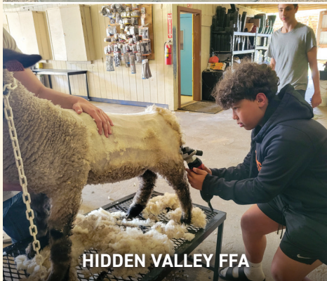
HIDDEN VALLEY FFA