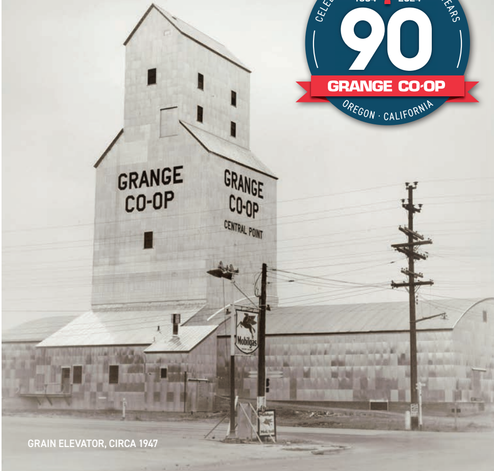
GRAIN ELEVATOR, CIRCA 1947