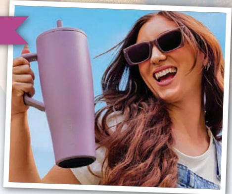
PHOTOS FOR ILLUSTRATIVE PURPOSES ONLY. ACTUAL COLORS AND STYLES MAY VARY.

BRÜMATE DRINKWARE SAVER EVERY SIP WITH LEAK-PROOF DRINKWARE FROM BRÜMATE!